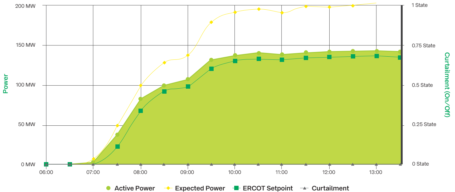
Figure 1 – Site Dashboard, Showing Actual & Expected Generation with Setpoints and Curtailments

BayWa r.e. Operation Services calculates expected energy as a function of plane-of-array irradiance (POAI), wind speed and ambient temperature. BayWa found that collecting these inputs in the conventional way, with meteorological (MET) stations, presented accuracy and reliability challenges.